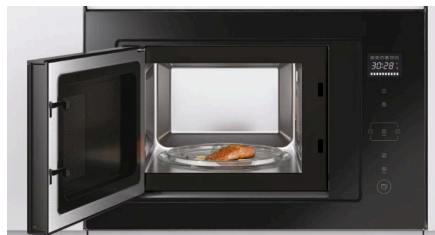
Stainless steel cavity